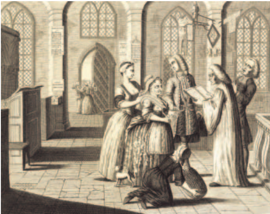
FIGURE 2: The interior of Marylebone Church, copied from Hogarth's Married to an old maid , Overton et al. 1735.

the church interior depicted by the plagiarists is so different from Hogarth's version 2 .