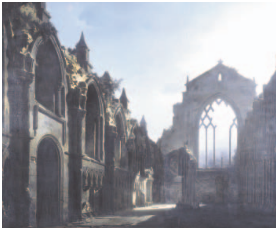
Daguerre's painting of the ruins of Holyrood Chapel – later made into a Diorama that was shown first in Paris (Oct1823-Sept1824), then in London (Mar-Dec1825), and which subsequently toured the UK.

Walker Art Gallery, Liverpool.