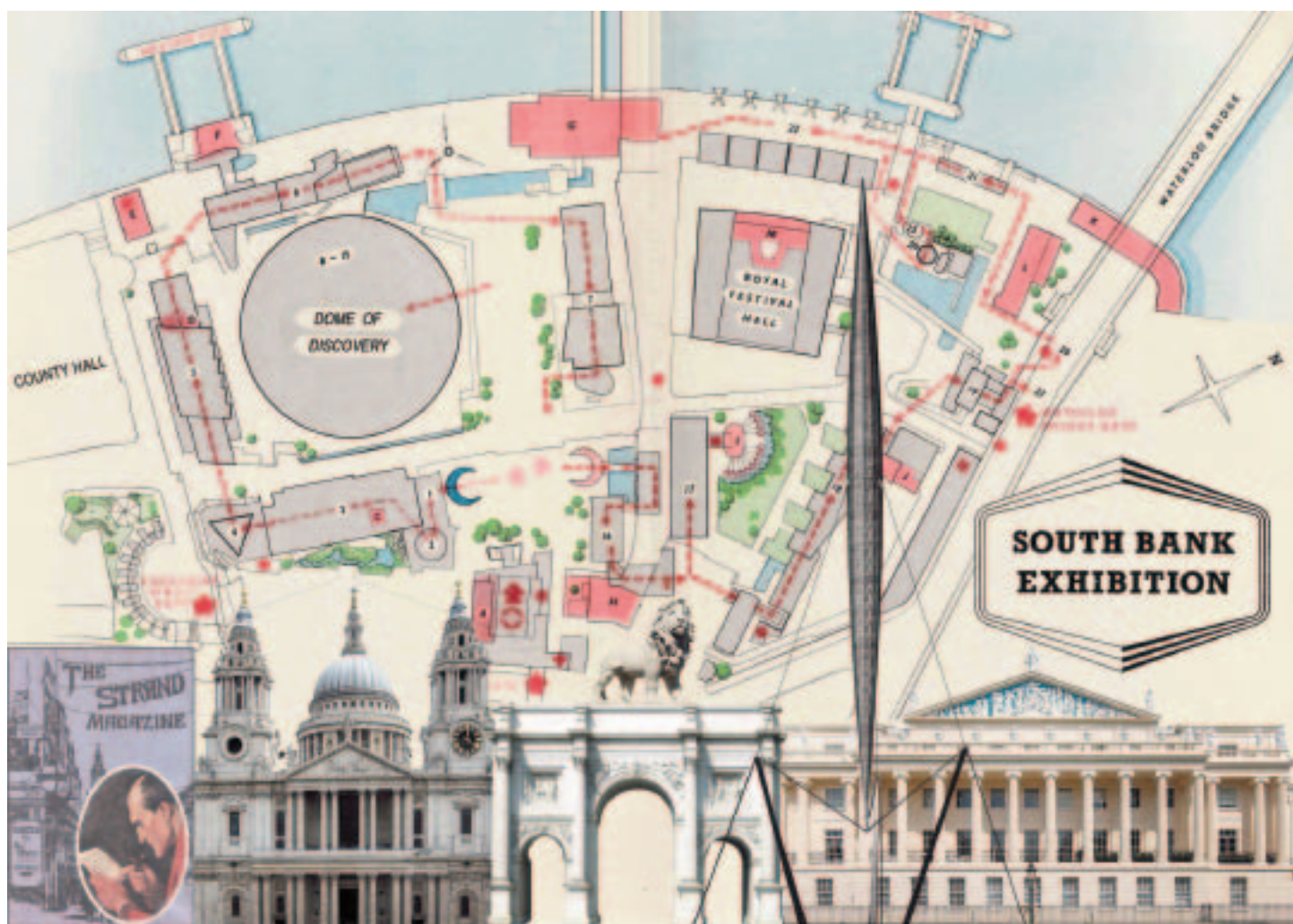
Plan of South Bank Exhibition from the Souvenir Guide, with foreground collage: Sherlock Holmes on Strand Magazine cover; St Paul's Cathedral; Marble Arch; the Coade Stone Lion statue from the Old Lion Brewery; the 300ft high Skylon needle; Regent's Park Nash Terrace.