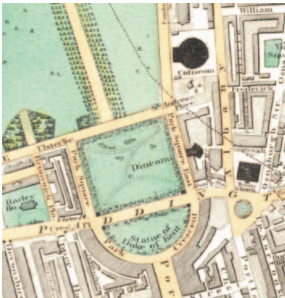
1827 Greenwood map showing location of the Diorama.

It is the last extant diorama building in the UK. The Nash façade is intact, but the much altered interior and rear were by Morgan 4 and Pugin 5 , working for John Nash.