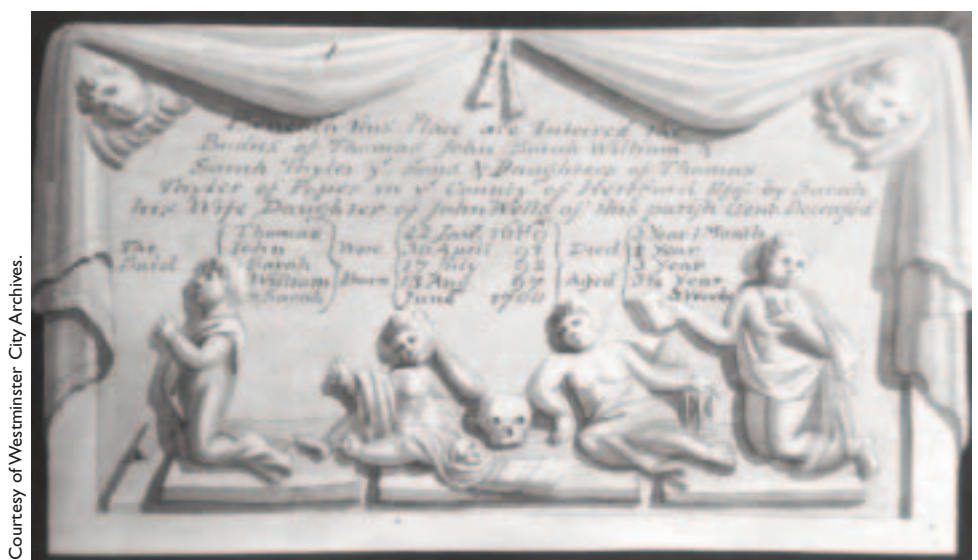
FIGURE 3: A wash drawing of the Tayler Monument from the c1400 Marylebone parish church (later transferred to the 1742 parish church).